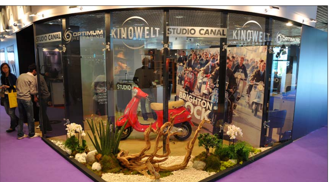
Studio Canal's stand at the Marche Du Film

The Iranian Alliance of Motion Picture Guilds' Stand at the Marche Du Film