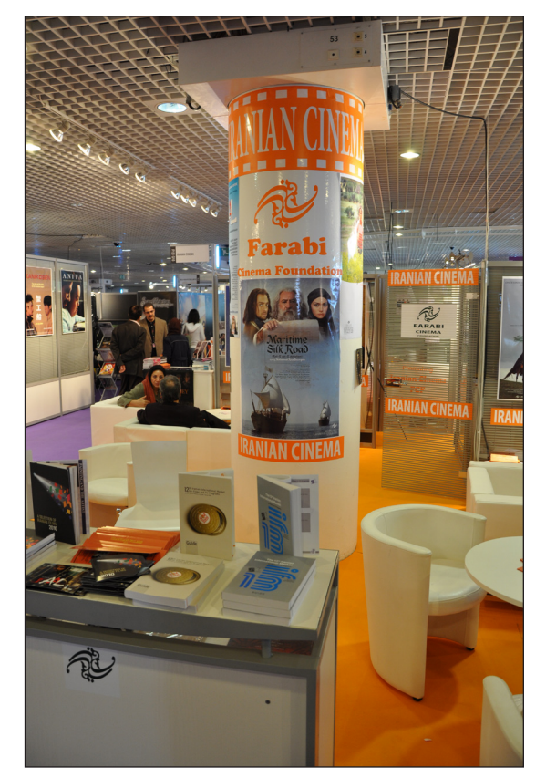
Farabi Cinema Foundation's Stand at the Marche Du Film